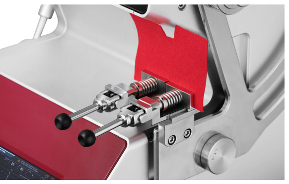
Lever Clamps hold the sample securely for making the initial cut and for testing.

The use of the optional "E" Pendulum increases the capacity of the PowerTear to 128 N for heavy duty materials.