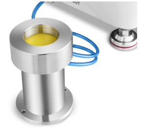
Optional fixture of Pore Size Test for BS 3321

Optional fixture of Blood Penetration Test for ASTM F1670, BS ISO 13994 and ISO 16603