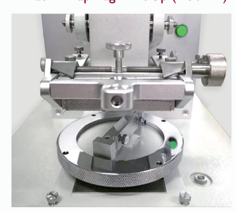
Edge Abrasion Set Up (Optional)