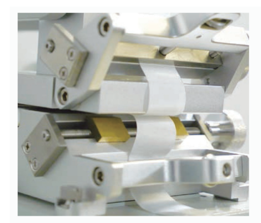
Flex Abrasion Set Up (Included)

The Universal Wear Tester was designed to run numerous tests and can be set up in many different ways.