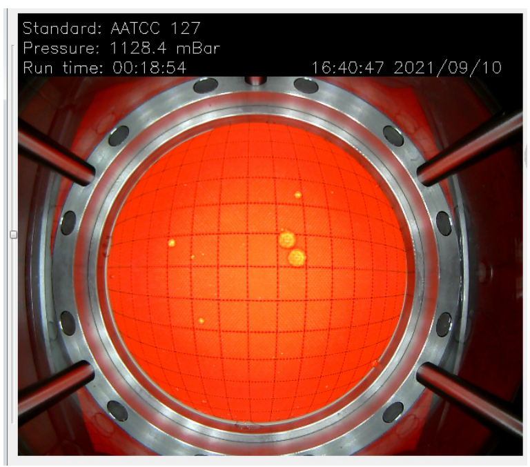
Video recording and image capture