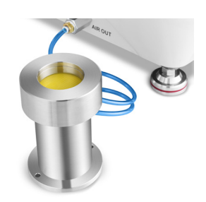
Optional fixture of Pore Size Test for BS 3321