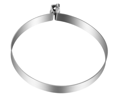
Quick Lock Sample Holder